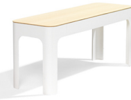
Cabin L50 Fredrik Mattson 2012 H500 D375 L1180