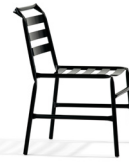
Straw O35 Osko + Deichmann 2010 H845 SH470 W475 D595