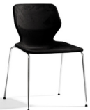
Boo O48 / O49 Stefan Borselius 2008 H830 SH455 W530 D530