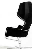
Peekaboo Swivel O43 Stefan Borselius 2005 H1275 SH380 W690 D740