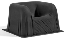
Spook O41 Iskos-Berlin 2011 H610 SH355 W990 D910