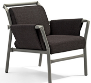
Superkink S35 Osko + Deichmann 2013 H800 SH400 W755 D843