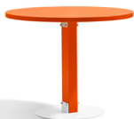
Size L91 Thomas Bernstrand 2013 H720 Ø750/900/1200