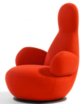
Oppo Large O52A Stefan Borselius 2009 H1045 SH390 W780 D900