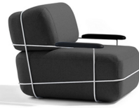
Pebble S400 Osko + Deichmann 2005 SH420 W790 D590