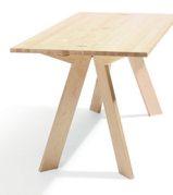
Simsalabim L21 Börge Lindau 1993 H715 W750 L1500/L2045