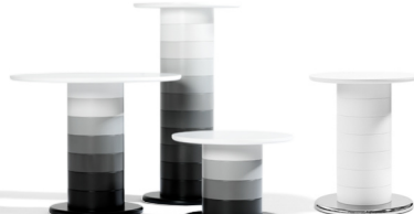
Babel L30 Fredrik Mattson 2008 H435/530/625/720/910/1005/1100 Ø600/750/900