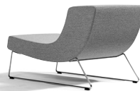
Fellow S300 Fredrik Mattson 2008 H720 SH380 W600 D815