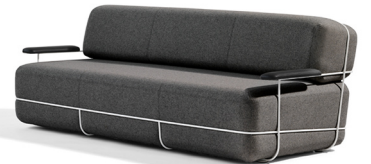
Pebble S402 & S403 Osko + Deichmann 2005 S402; H750 SH420 D1030 W1347 S403; W2040