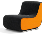
Ally S06 Hertel & Klarhoefer 2012 H670 SH380 W600 D850