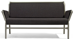
Superkink S36 Osko + Deichmann 2013 H800 SH400 W1600 D843