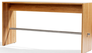
Ping-Pong L23 bar table Johan Lindau 2001 H1070 W600 L2000