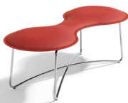
Small Island O80 Tomoyuki Matsuoka 2001 H445 D550 W1330