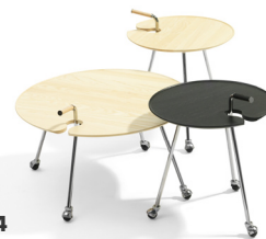
Pond 84 Mia Cullin 2013 H400 Ø750, H500 Ø500