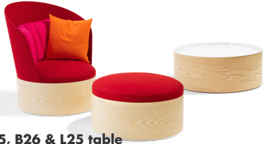
B25, B26 & L25 table Cate & Nelson 2011 H980 SH400 W930 D870 Ø780. B26/SH400 L25/H302