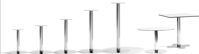
Bit L6 pedestal & table Bit L7 Börge Lindau 1992 H453/573/693/873/1043, foot Ø490 tops Ø600/750/900 700x700/700x1400