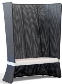
Antoinette S55 Cate & Nelson 2010 H1750 SH470 D690 L1325