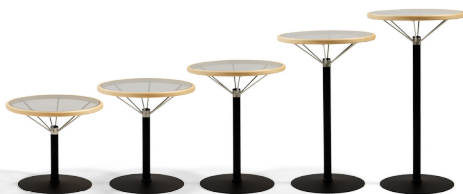
L1 Börge Lindau 1987 H590/710/890/1060 Ø480/580/680