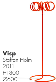
Visp Staffan Holm 2011 H1800 Ø600