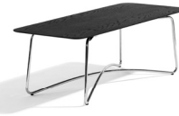
Long Island L80 Tomoyuki Matsuoka 2001 H410 D550 L1325