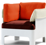
Koja S51L Fredrik Mattson 2008 H830 SH440 W770 D740