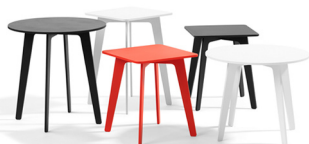
Mika L28 Mika Tolvanen 2012 H500/H400 top 450x280, 375x375, Ø500