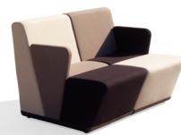
Fellow S301-S302 Fredrik Mattson 2008 H720 SH380 W600 D815