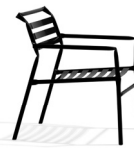
Straw Lounge O36 Osko + Deichmann 2010 H750 SH360 W605 D660