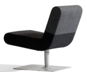
Elle O74 Fredrik Mattson 2002 H716 SH420 W500 D760