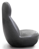
OppoCement O51L Stefan Borselius 2009 H1040 SH350 W700 D900