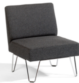
Qvarto S10 middle Börge Lindau 1999 H800 SH400 W660 D770