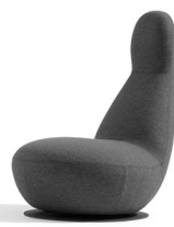
Oppo Large O52 Stefan Borselius 2009 H1045 SH390 W700 D900