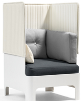
Koja S51H Fredrik Mattson 2008 H1210 SH440 W770 D740