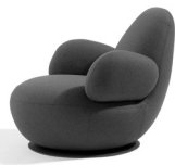
Oppo Small O50A Stefan Borselius 2009 H725 SH390 W780 D900