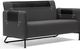
Taylor Sofa S37 Mia Gammelgaard 2013 H790 SH400 W660 D770