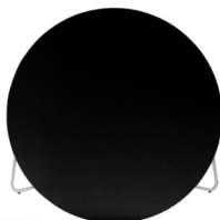
Big Island L82 Tomoyuki Matsuoka 2001 H410 Ø1150