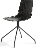
Dent B50S O4i 2013 H810 SH455 W495 D510