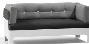
Koja S52L Fredrik Mattson 2008 H830 SH440 D740 W1830