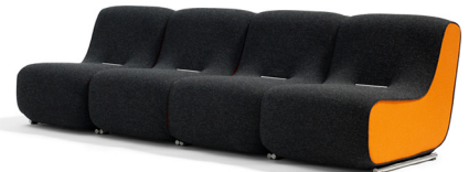
Ally S06 Hertel & Klarhoefer 2012 4xH670 SH380 W600 D850