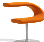
Innovation C O70 Fredrik Mattson 2001 H750 SH480 W700 D650