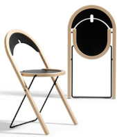
Sparta B15 Börge Lindau 1993 H790 SH460 W480 D490