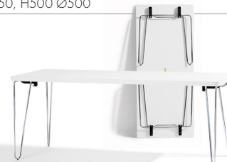
Clip L41 Jonas Forsman 2005 H735 W800 L1400/L1850/ L2050, W600 L1400