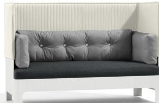
Koja S52H Fredrik Mattson 2008 H1210 SH440 D740 W1830