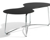
Small Island L80 Tomoyuki Matsuoka 2001 H410 D550 L1325