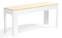
Cabin L50 Fredrik Mattson 2012 H500 D375 L1180