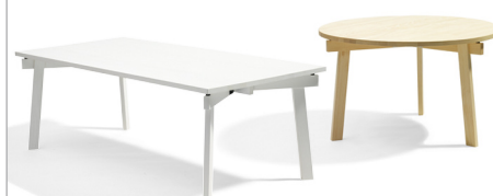
Size L90 Thomas Bernstrand 2013 H720 tabletop; round square, rectangular in any size