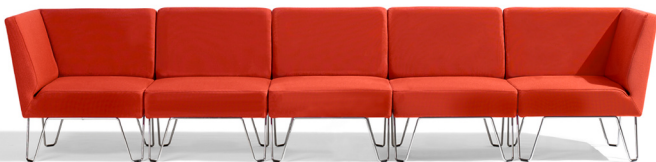
Qvarto S10 corner & middle Börge Lindau 1999. (Lindau & Lindekrantz 1965) 2x H800 SH400 W770 D770 3x H800 SH400 W660 D770