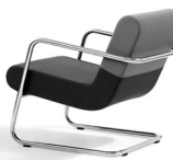
Ella O76 Fredrik Mattson 2002-11 H780 SH420 W575 D780