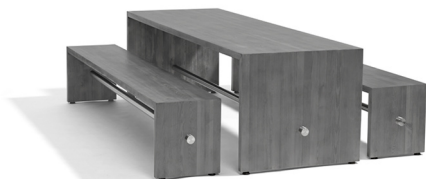
Ping-Pong L23 bench & table Johan Lindau 2001 SH460 W400 L2380 Table; H720 W800 L2500