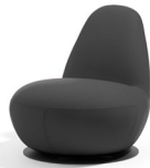
Oppo Small O50 Stefan Borselius 2009 H725 SH390 W700 D900