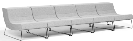
Fatback SO1 & SO2 Fredrik Mattson 2005 SO1: H605 SH355 W600 D1000, SO2: H605 SH355 WF400 WB700 D1000