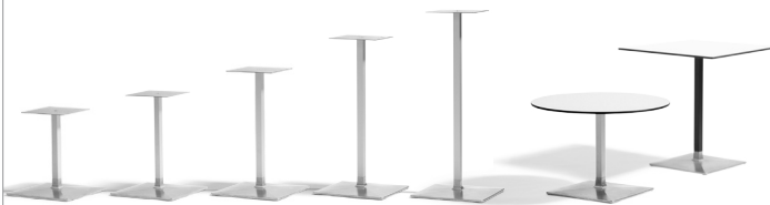
Level L31 pedestal & table Level L32 Borselius & Mattson 2004 H458/588/708/888/1058 foot 430x430 tops Ø600/750/900 700x700/700x1400