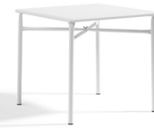
Straw L35 Osco + Deichmann 2012 H720 W700 D700